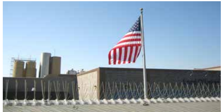
Bird Spike 2001™ installed on a parapet wall.