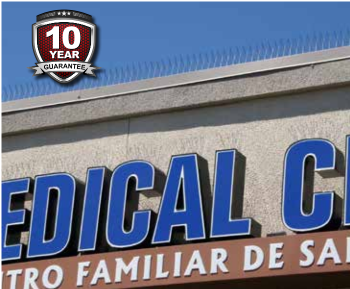
Bird Spike 2001™ installed over channel letters and parapet wall.