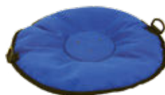
Sand Bag Base